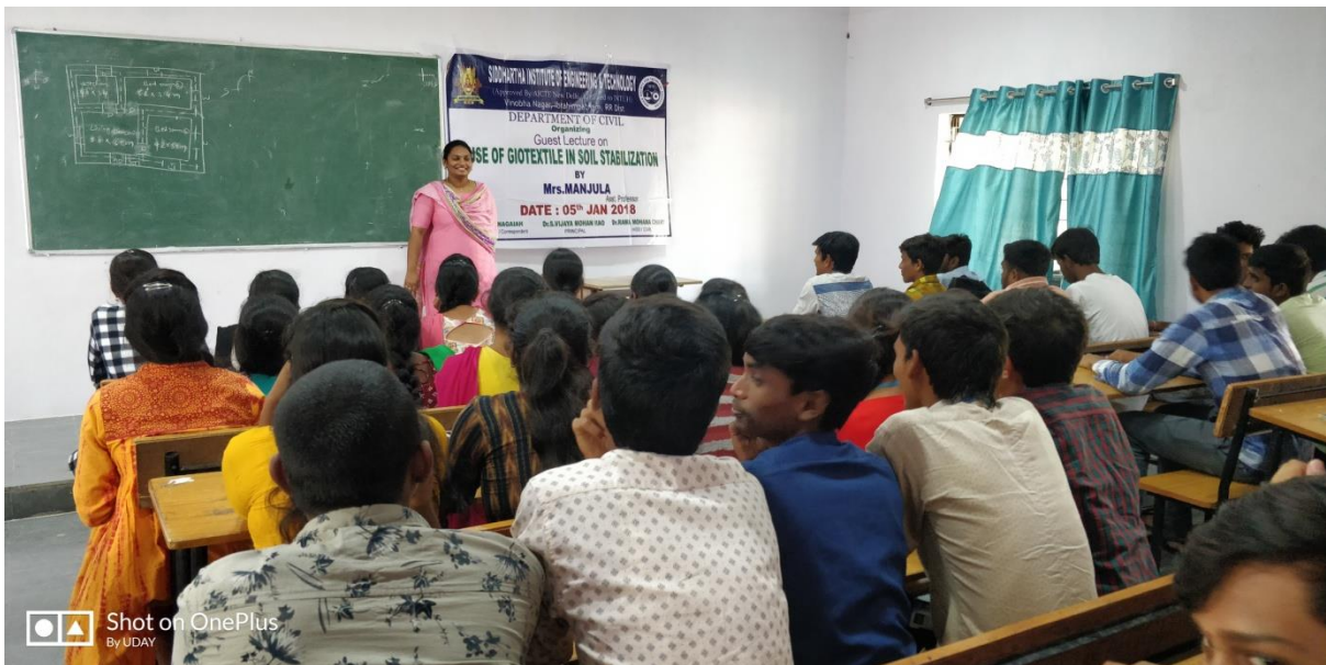
Guest Lecture on Use of Geo-textile In Soil Stabilization