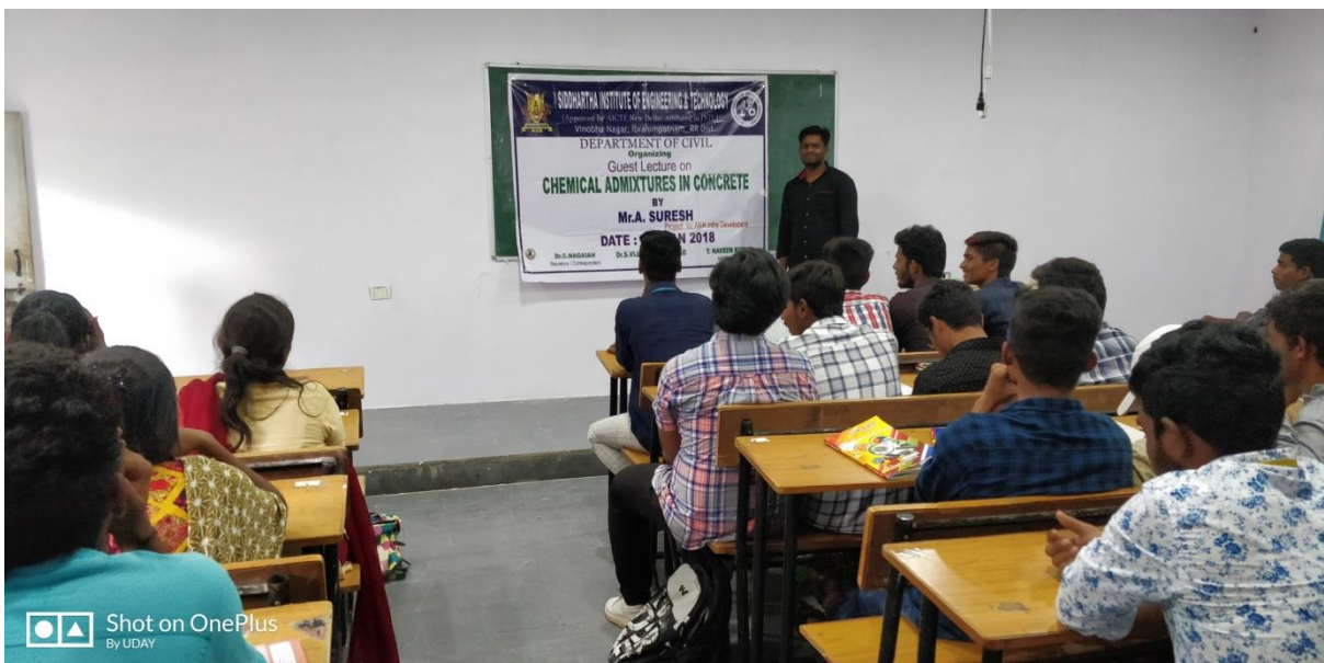
Guest Lecture on Chemical Admixtures In Concrete