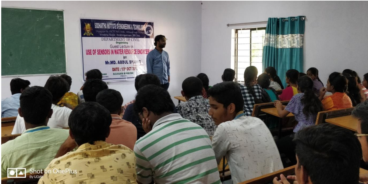
Guest Lecture on Water Resource Engineering